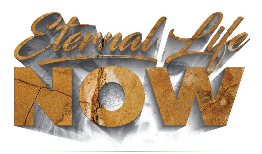
This is the promise which He Himself made to us: Eternal Life ~1 John 2:25